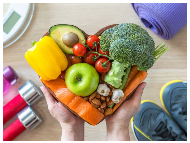
Eat Healthy, Be Active is one of the many programs that our community nutrition instructors use to help participants make better food choices and increase physical activity.